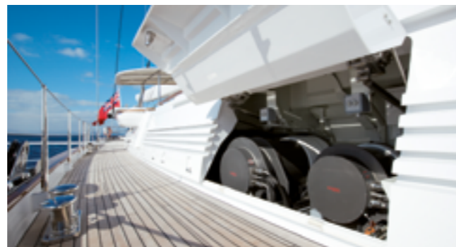
The ultimate challenge for rope performance and longevity