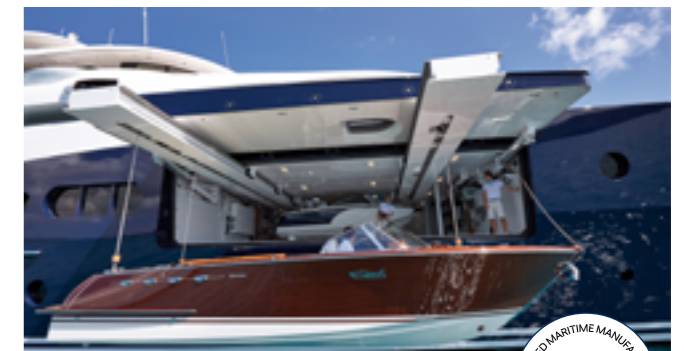
The first textile davit rope with DNV approval

Gleistein's DynaOne® HS GeoBend replaces the wire ropes in an existing davit system without any modifications being required. The rope, which is specially designed to handle alternating bends under load, significantly exceeds the strength of an equally dimensioned wire rope and thereby allows for an even higher safety factor. That's why it has also received the strict DNV Type Approval Certification for manned tender boats.