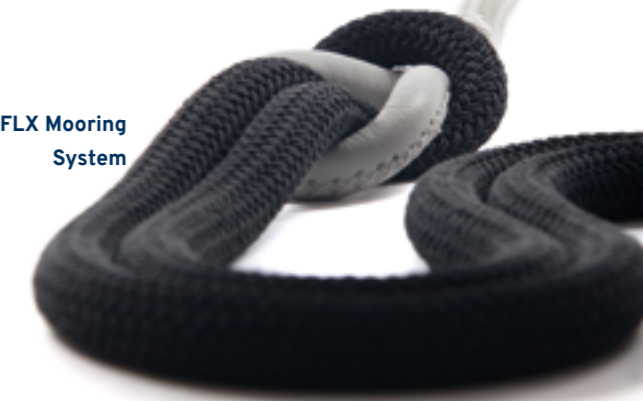
FLX Mooring System

Wear and tear of mooring lines is inevitable – so they must be regularly replaced. With the FLX Mooring System, an inexpensive and easy-to-replace tail acts as a sacrificial element to do the “dirty work”. In this way, the high-performance main line made with Dyneema®, is effectively protected. This means that the investment will pay off in just a few short years. Furthermore, the solution requires substantially less space on board than a conventional line and the ensemble weighs just a fraction.